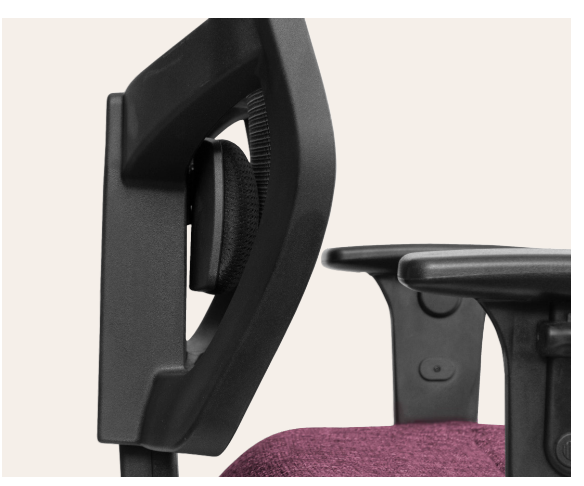
Pictured with the optional patented Gregory Dual Density Mkll Seat

Equipped with a robust 5-star base made of high-quality materials and smooth-rolling castors, the Sicura Ergonomic Mesh Back Chair offers stability and effortless mobility across various floor surfaces. The chair's rotating mechanism and adjustable seat height allow for personalised adjustments, ensuring you find the perfect seating position for your needs.